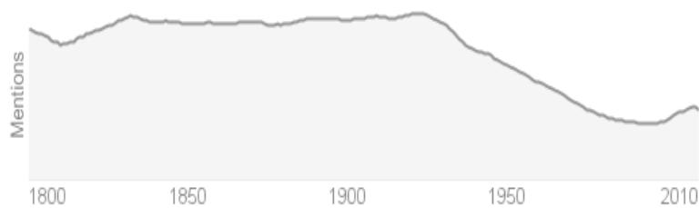
Use over time for: habit